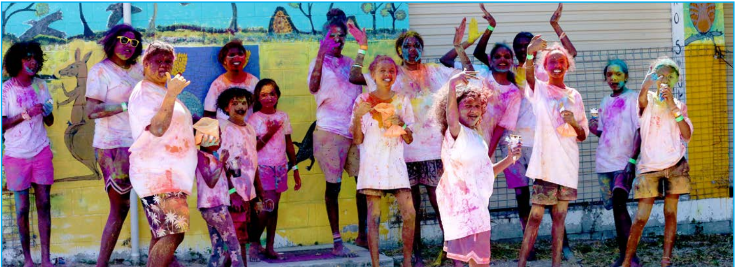
HEAPS more pics to come - watch our Facebook pages for details.